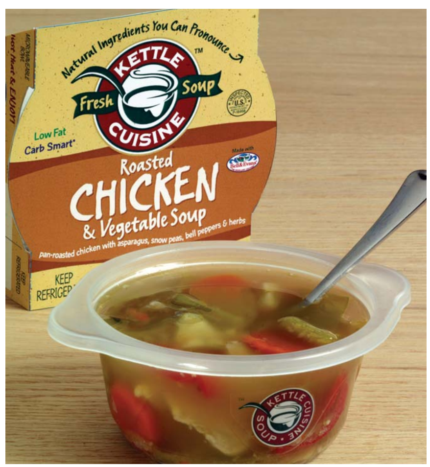
Clear single-serving bowls allow consumers to see the product.