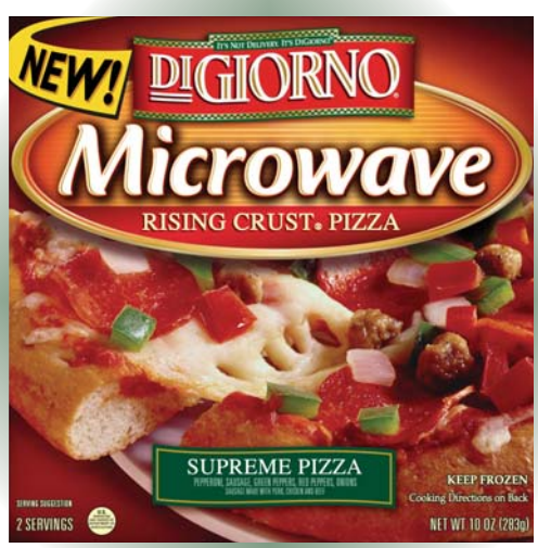
DiGiorno Microwaveable Rising Crust Pizzas feature both a cooking tray and crisping ring.

"Only 17 percent of frozen pizza is made in the microwave," he adds. "Clearly, an opportunity exists for a premium microwave pizza that tastes oven-baked and is ready in just five minutes."